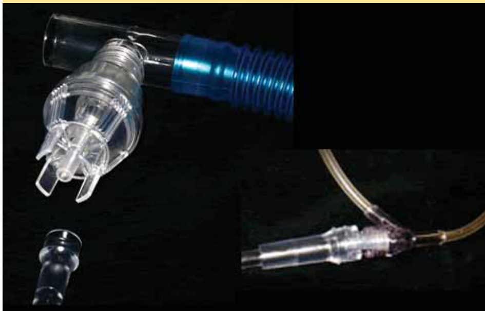
Tube delivering oxygen fell off nebulizer