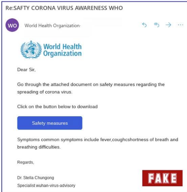
COVID-19 phishing impersonating the WHO